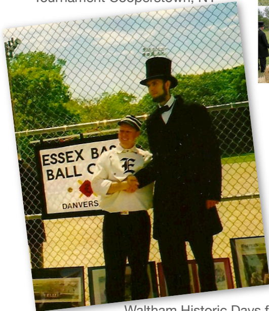
Waltham Historic Days for the Greater Boston Civi War Roundtable