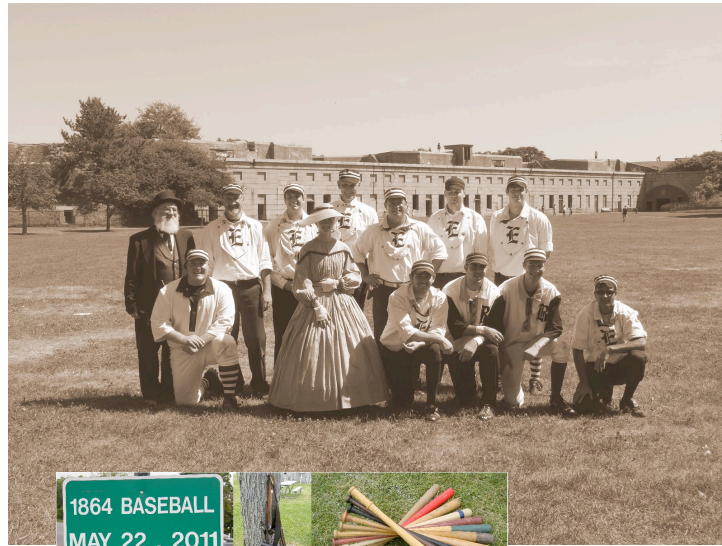
Georges Island, Boston Harbor