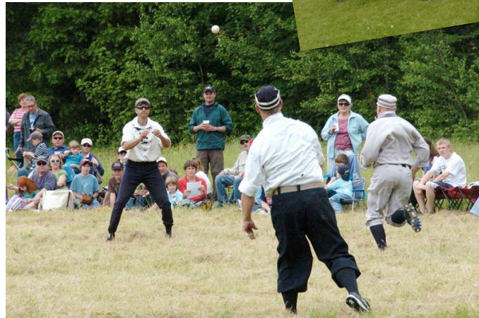
Freeport Maine Exhibition